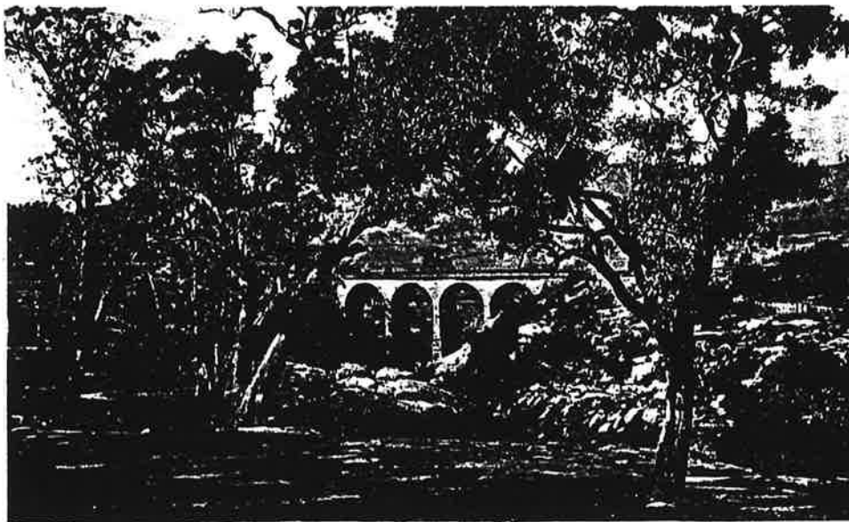
The Viaduct, from Victoria Bridge.