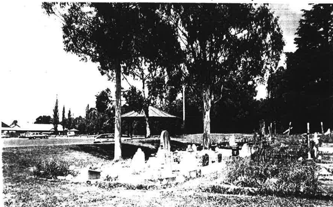
PICTON VILLAGE SQUARE

Should we be surprised that every person, without fail, recognises Stonequarry Creek as the focal point of Picton? It is our childrens' heritage and our lifeline into the twenty-first century.