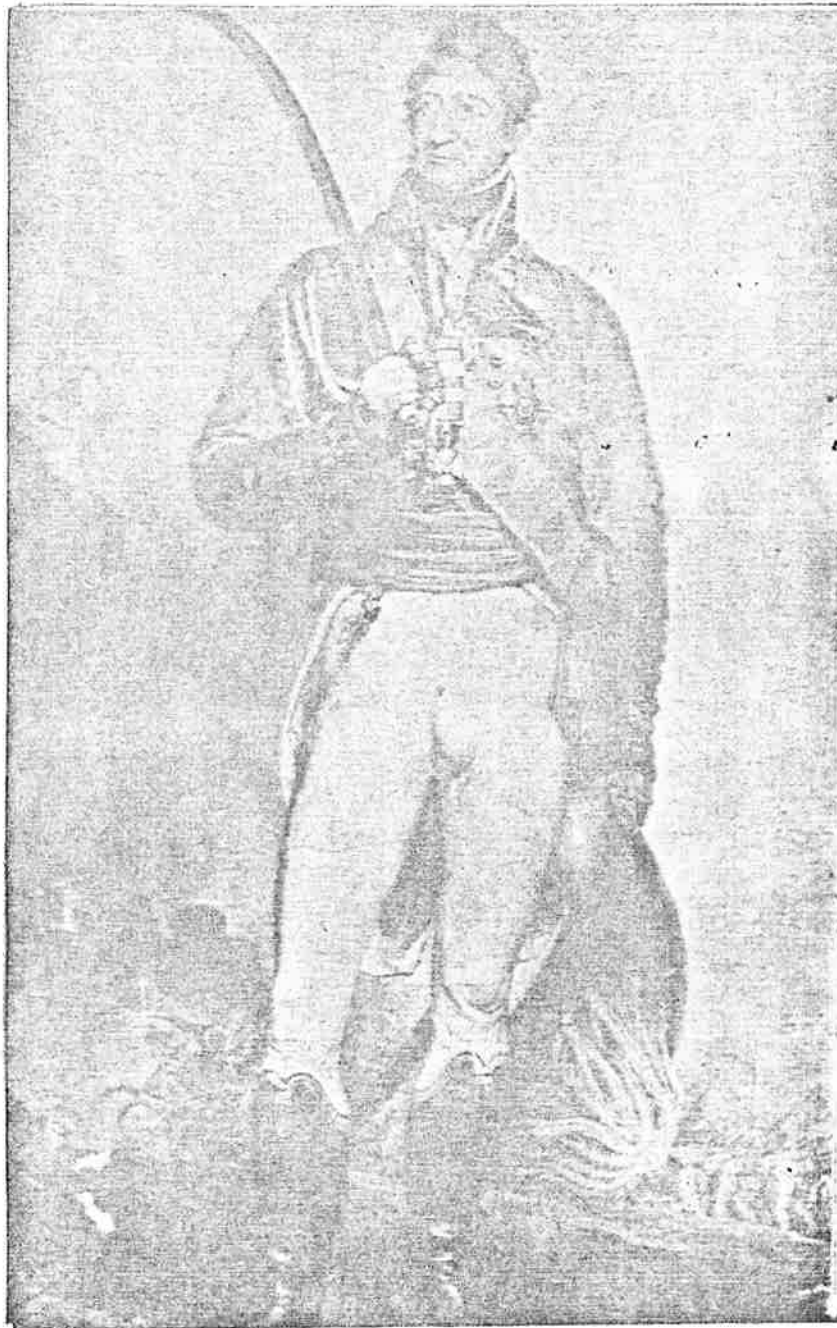
LIEUT - GENERAL SIR THOMAS PICTON K.G.C.B.