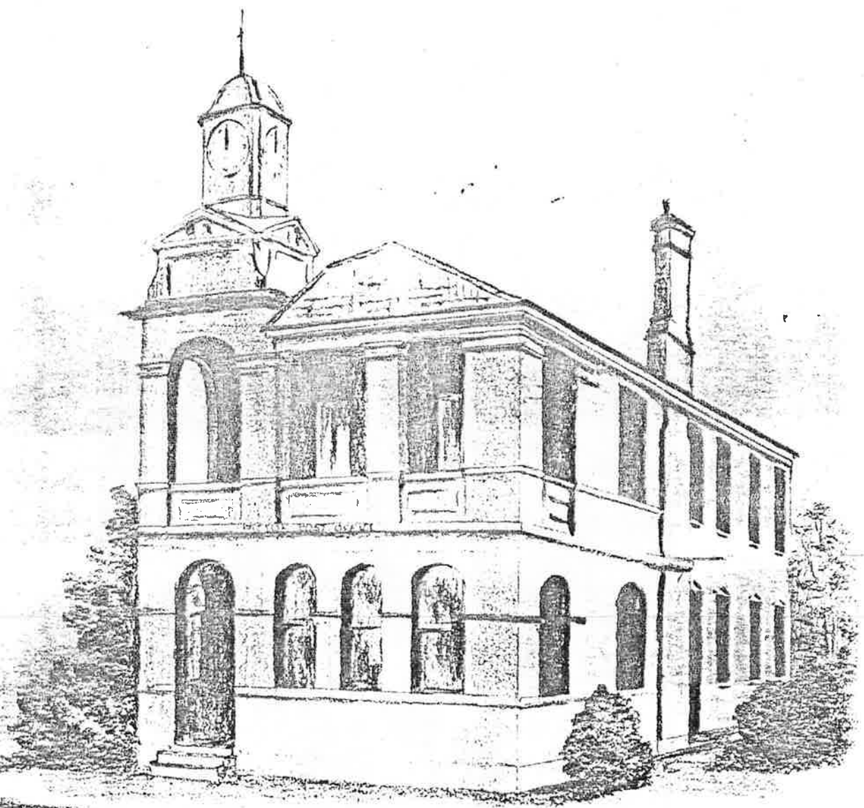
Picton Post Office